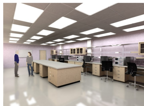
Sensors & Control Lab